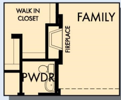
OPTIONAL WALL FIREPLACE AT FAMILY

sq. ft. • Bedrooms • Full Baths • Half Baths • Car Garage