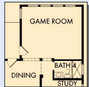
OPTIONAL GAME ROOM WITH BATH 4