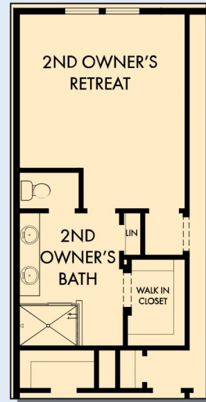
OPTIONAL 2ND OWNER'S RETREAT WITH 2ND OWNER'S BATH AT BEDROOM 4 AND 5

For additional options, please visit DavidWeekleyHomes.com