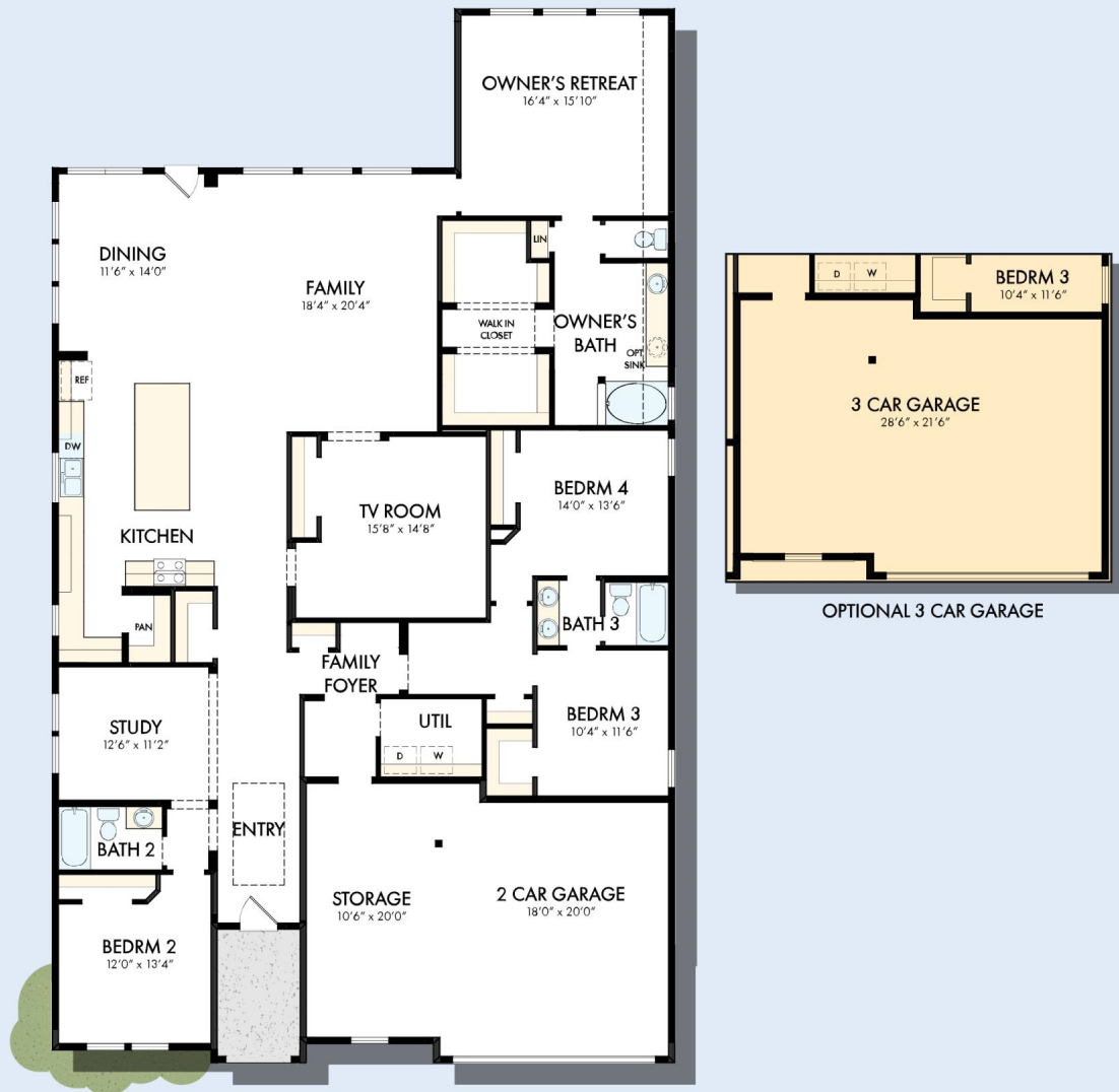
OPTIONAL 3 CAR GARAGE