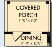
OPTIONAL COVERED PORCH AT DINING