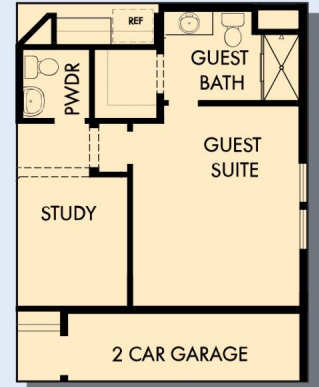
OPTIONAL GUEST SUITE WITH POWDER BATH AT BEDROOM 2 AND 3