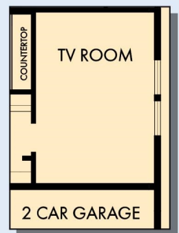
OPTIONAL TV ROOM AT GARAGE