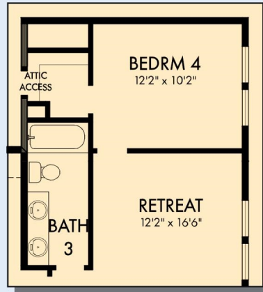
OPTIONAL BEDROOM 4 AT RETREAT