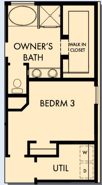
OPTIONAL SEPARATE TUB AND SHOWER AT OWNER'S BATH