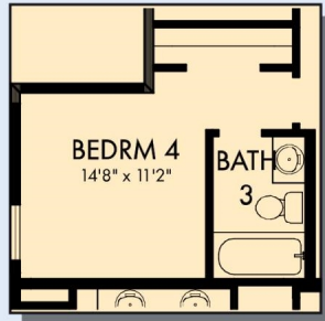
OPTIONAL BEDROOM 4 WITH BATH 3 AT RETREAT