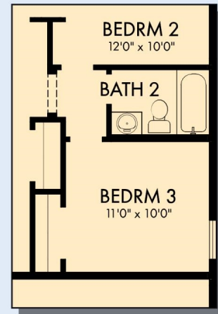
OPTIONAL BEDROOM 3 AT STUDY