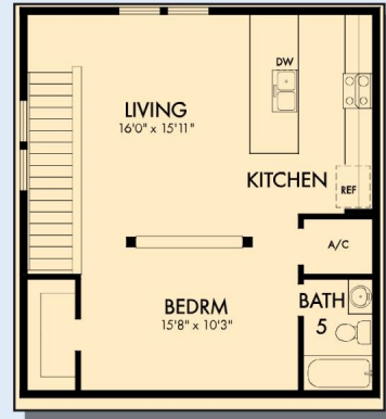
SECOND FLOOR WITH OPTIONAL GARAGE RETREAT AND KICHENETTE