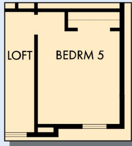
OPTIONAL BEDROOM 5 AT RETREAT