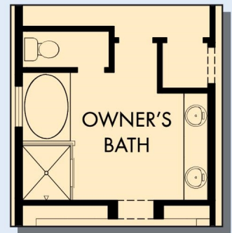
OPTIONAL SLIDE IN TUB WITH SEPARATE SHOWER AT OWNER'S BATH