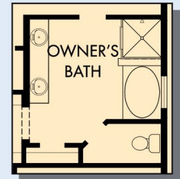
OPTIONAL SLIDE-IN TUB WITH SHOWER AT OWNER'S BATH