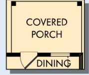
OPTIONAL COVERED PORCH AT DINING