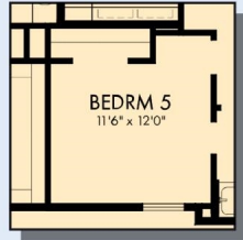
OPTIONAL BEDROOM 5 AT CRAFT