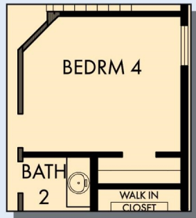
OPTIONAL BEDROOM 4 AT RETREAT