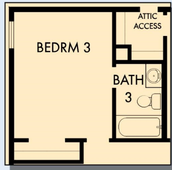
OPTIONAL BATH 3