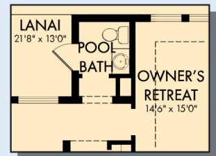
OPTIONAL POOL BATH AT LANAI