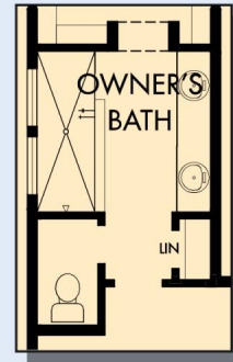
OPTIONAL SUPER SHOWER AT OWNER'S BATH