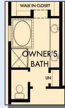
OPTIONAL DROP-IN TUB WITH SEPARATE SHOWER AT OWNER'S BATH