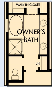
OPTIONAL SLIDE IN TUB WITH SEPARATE SHOWER AT OWNER'S BATH