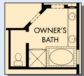
OPTIONAL DROP-IN TUB WITH SEPARATE SHOWER AT OWNER'S BATH