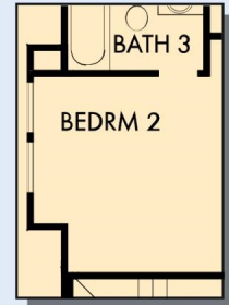
SECOND FLOOR WITH OPTIONAL ENHANCED SIDE

For additional options, please visit DavidWeekleyHomes.com