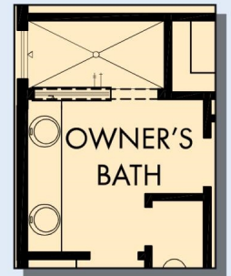
OPTIONAL SUPER SHOWER AT OWNER'S BATH