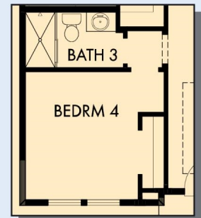
OPTIONAL BEDROOM 4 WITH BATH 3 AT STUDY