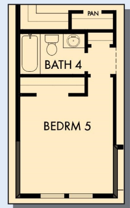
OPTIONAL BEDRM 5 AND BATH 4 AT STUDY