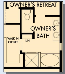
OPTIONAL SLIDE-IN TUB WITH SEPARATE SHOWER AT OWNER'S BATH