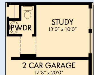
OPTIONAL POWDER BATH AT STUDY