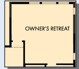
OPTIONAL EXTENDED OWNER'S RETREAT