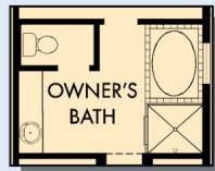
OPTIONAL DROP-IN TUB WITH SEPARATE SHOWER AT OWNER'S BATH