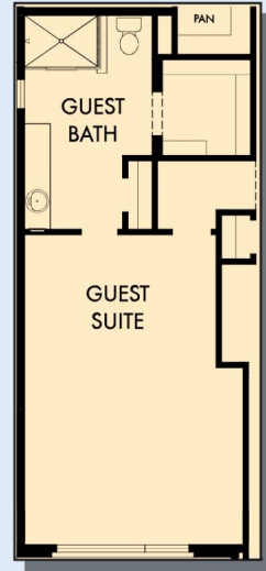
OPTIONAL GUEST SUITE WITH GUEST BATH AT BEDROOM 2 AND 3