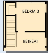
FIRST FLOOR WITH OPTIONAL BASEMENT

2,208 - 3,942 sq. ft. • 3 - 4 Bedrooms • 2 - 3 Full Baths • 0 - 1 Half Baths • 2 Car Garage