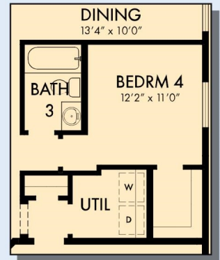
OPTIONAL BEDROOM 4 WITH BATH 3 AT STUDY