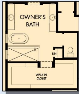
OPTIONAL FREE STANDING TUB AT OWNER'S BATH