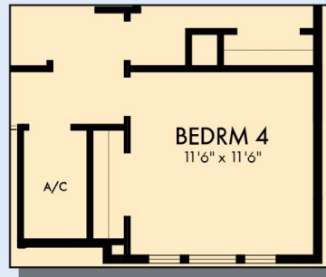
OPTIONAL BEDROOM 4 AT RETREAT