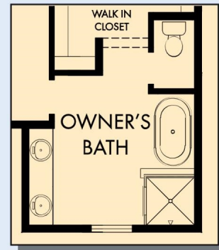
OPTIONAL FREE STANDING TUB WITH SEPARATE SHOWER AT OWNER'S BATH