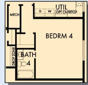
OPTIONAL BEDROOM 4 WITH BATH 4 AT GARAGE