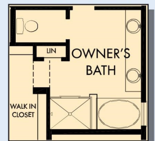
OPTIONAL SLIP-IN TUB WITH SEPARATE SHOWER AT OWNER'S BATH