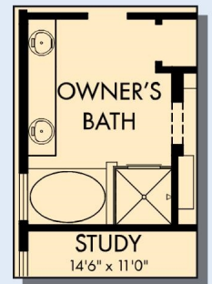
OPTIONAL SLIP IN TUB WITH SEPARATE SHOWER AT OWNER'S BATH