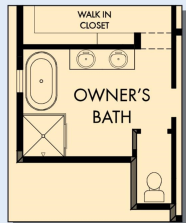
OPTIONAL FREESTANDING TUB WITH SEPARATE SHOWER AT OWNER'S BATH

For additional options, please visit DavidWeekleyHomes.com