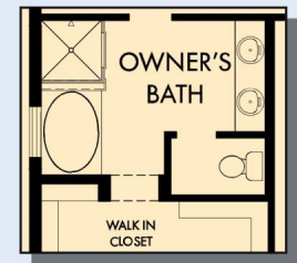
OPTIONAL SLIDE-IN TUB WITH SEPARATE SHOWER AT OWNER'S BATH