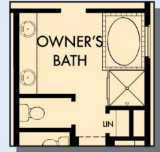
OPTIONAL DROP-IN TUB WITH SHOWER AT OWNER'S BATH