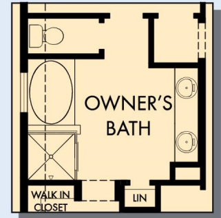
OPTIONAL SLIDE IN TUB WITH SEPARATE SHOWER AT OWNER'S BATH