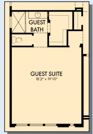
OPTIONAL GUEST SUITE WITH GUEST BATH AT BEDROOM 3 AND BEDROOM 4