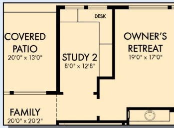
OPTIONAL STUDY 2