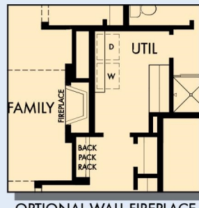
OPTIONAL WALL FIREPLACE AT FAMILY