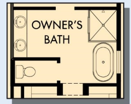
OPTIONAL FREE-STANDING TUB WITH SEPARATE SHOWER AT OWNER'S BATH