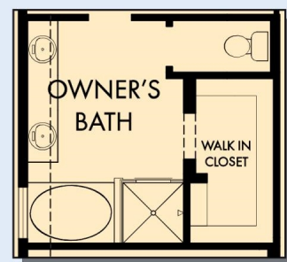
OPTIONAL SLIDE IN TUB WITH SEPARATE SHOWER AT OWNER'S BATH