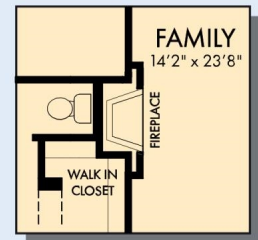
OPTIONAL WALL FIREPLACE AT FAMILY