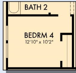
OPTIONAL BEDROOM 4 AT STUDY

2,291 - 2,321 sq. ft. • 3 - 4 Bedrooms • 3 Full Baths • 2 Car Garage