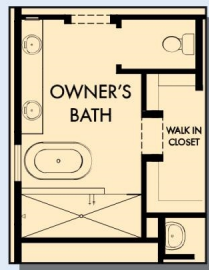
OPTIONAL FREE STANDING TUB AT OWNER'S BATH

2,853 - 2,855 sq. ft. • 3 Bedrooms • 3 Full Baths • 1 Half Bath • 3 Car Garage