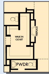
OPTIONAL WALL FIREPLACE AT FAMILY