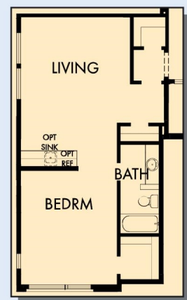
OPTIONAL GUEST SUITE