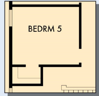
OPTIONAL BEDROOM 5 AT RETREAT