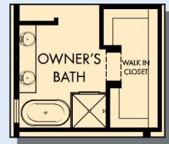
OPTIONAL FREE-STANDING TUB WITH SEPARATE SHOWER AT OWNER'S BATH